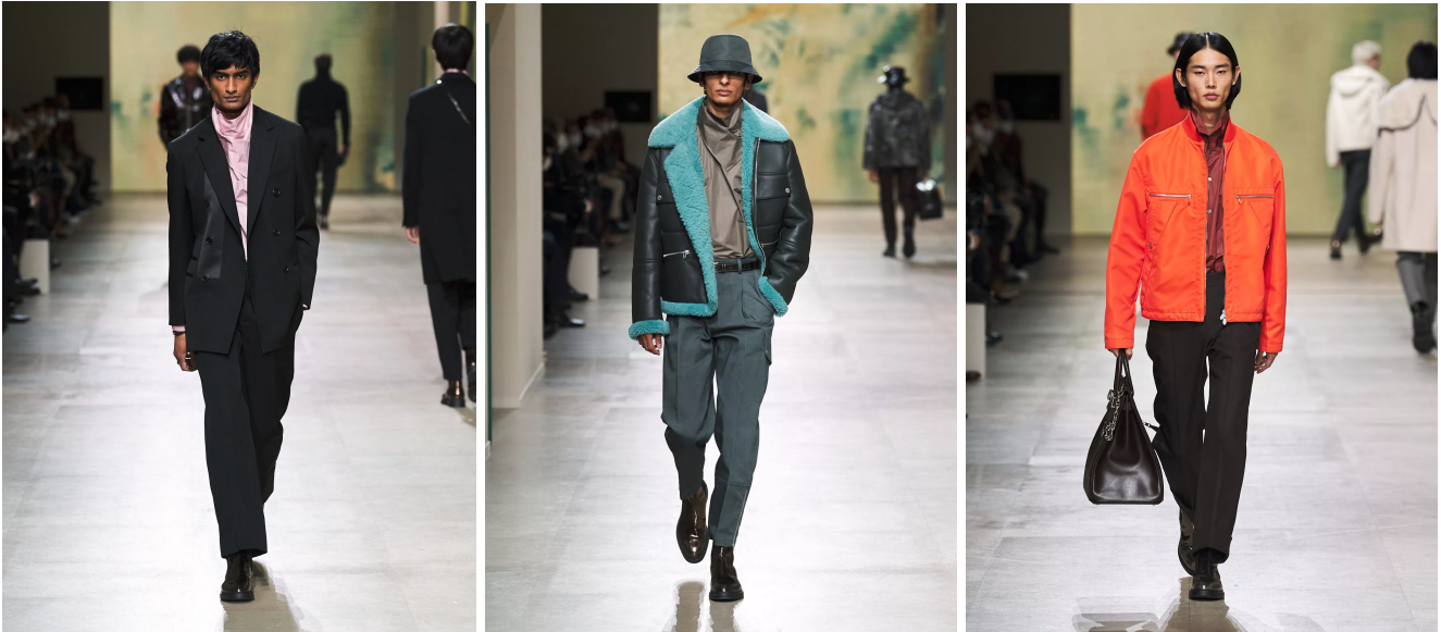
Fall/Winter 2022-2023